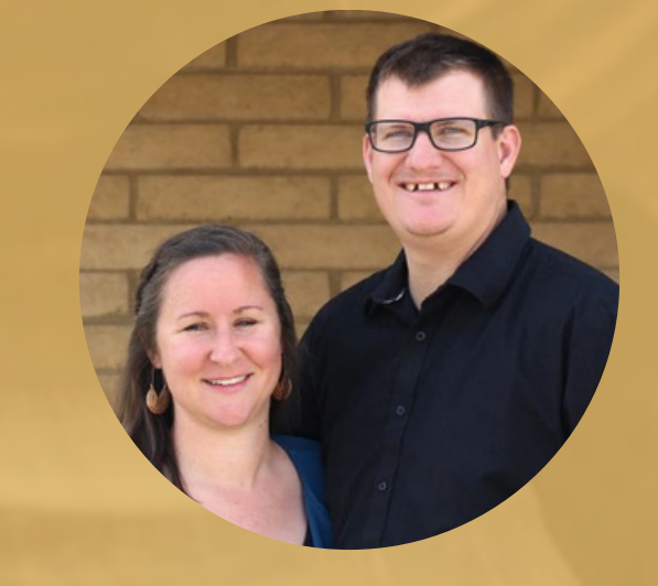
The Irvines CHURCH PLANTING INTERNS

11611 N. 51ST AVENUE. GLENDALE, AZ 85304